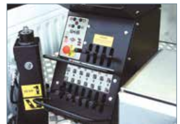
Hydraulic and 12V DC emergency ground controls

The photographs in this brochure are for promotional purposes only. Specifications are subject to change without notice.