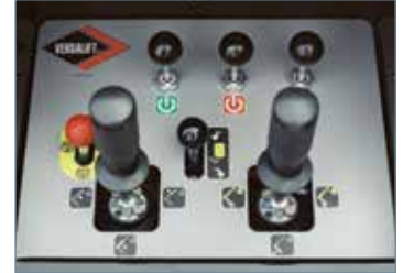
Easy to use fully hydraulic proportional control