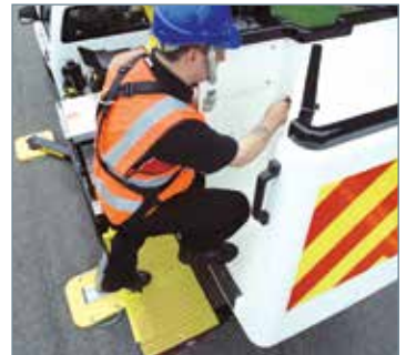
Safe access to bucket