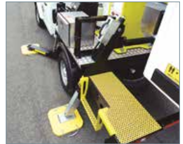
Improved stability via radial outriggers (front) + A-frame outriggers (rear), reducing stress to chassis