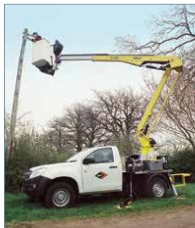
Improved driving experience on-road and impressive off-road capability