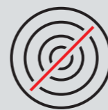
ø 12.5 cm / 5" max.